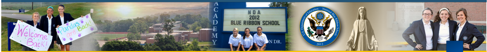
An e-Newsletter for the Families of Notre Dame Academy